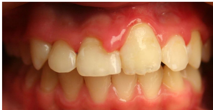
Fig. 4. Visualization of relapse

It was decided to carry out a computer tomography to establish a complete diagnosis that was obtained by the consent of the parents. The results of computer tomography differed significantly from the image on orthopantomogram. There was confirmed the presence of a dichotomy tooth in the projection of the root of the 21 tooth, which probably caused the corresponding position of the tooth and led to a recurrence of overlapping teeth of the upper jaw with systemic pathology of class 2 ( Fig. 5, 6 ).