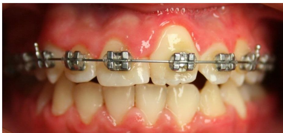
Fig. 2. End of the active phase

In the process of patient examination and orthodontic-surgical treatment with a total duration of 18 months, positive therapeutic changes were made for correction of tooth-jaw anomaly ( Fig. 2 ).