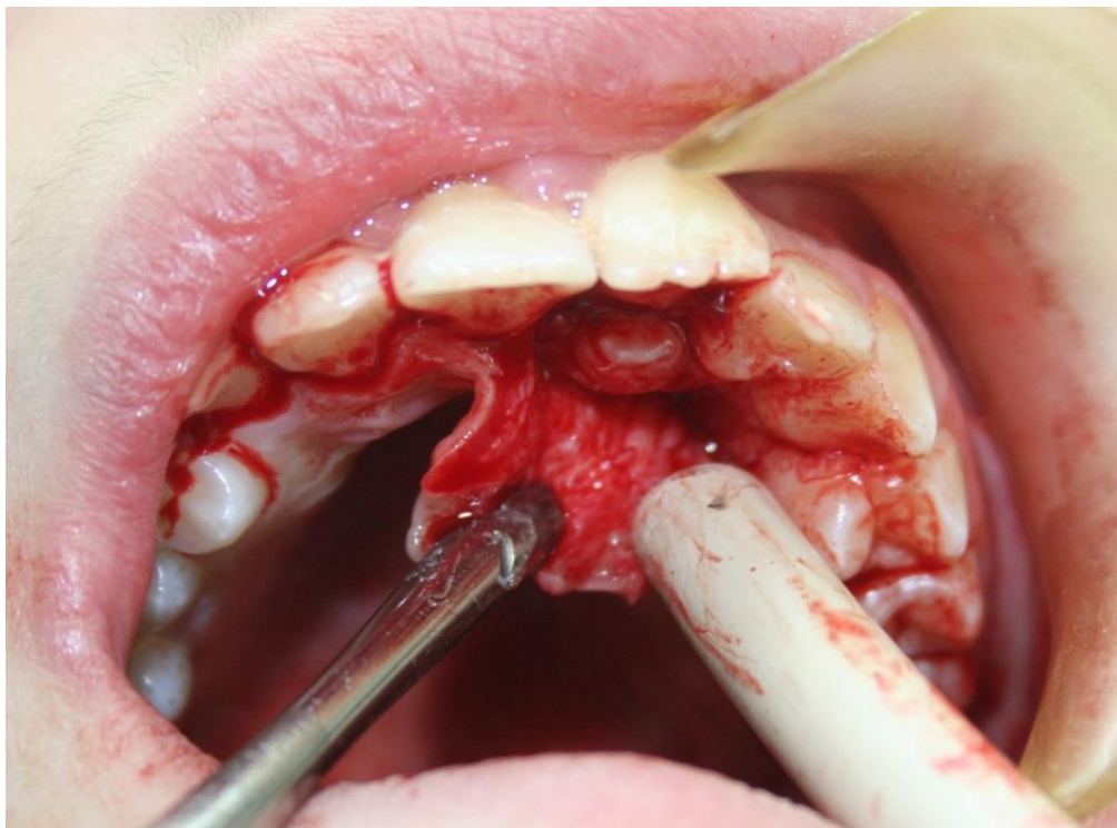
Fig. 7. Surgical stage

Thus, we state the practical impossibility to establish the exact number of supernumerary teeth in multiple hyperdontia only if the orthopantomography is performed and we can testify to the effectiveness of using tapered-beam tomography for quality diagnostics, refinement of the diagnosis in cases of systemic hyperdontia and multiple retention of permanent teeth in the planning of joint orthodontic-surgical interventions. According to the results of computer tomography, a plan of surgical operation and subsequent re-orthodontic correction was made ( Fig. 7 ).