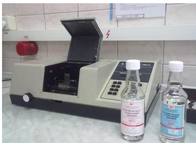
Fig. 3. Determination of mass concentration of aldehydes in special vodka of TM “Pervak”

Mass concentration of fusel oil in recalculation on mixture of isoamyl and isobutyl alcohols (1:1) in absolute alcohol was determined by reaction of fusel oil with salicylic aldehyde at presence of concentrated sulfuric acid using photoelectrocolorimeter.