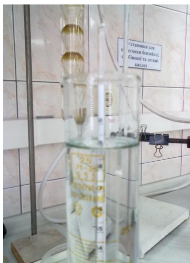
Fig. 1. Determination of strength of vodka of TM “Pervak” with help of glass alcoholmeter

The content of alcohol is determined by dependence of its concentration from the relative density of solution that is determined by aerometric method using the glass alcoholmeter ( Fig. 1 ).