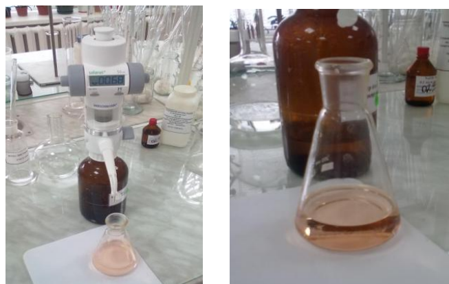
Fig. 2. Determination of alkalinity of special vodka of TM “Pervak”