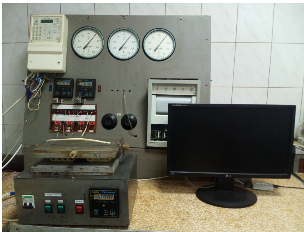
Fig. 2. Experimental stand for studying the process of the bilateral frying of meat natural products