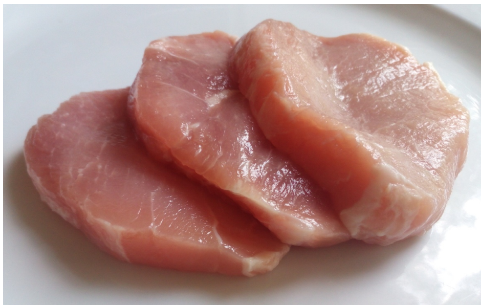
Fig. 3. Natural semi-products of pork

To determine the thermodynamic process duration in capillary menisci using the digital Dictaphone LG, the sound of the frying process was recorded. The Dictaphone was placed on the support at the semi-product height at the distance 0,2 m from the front of the research-experimental sample of the apparatus. For the further analysis of the sound file Fabfilter Pro-Q2 (Fabfilter software instruments, country producer – USA, Canada) and Spectrum Player (Isualization Software LLC, country producer – USA) programs were used.