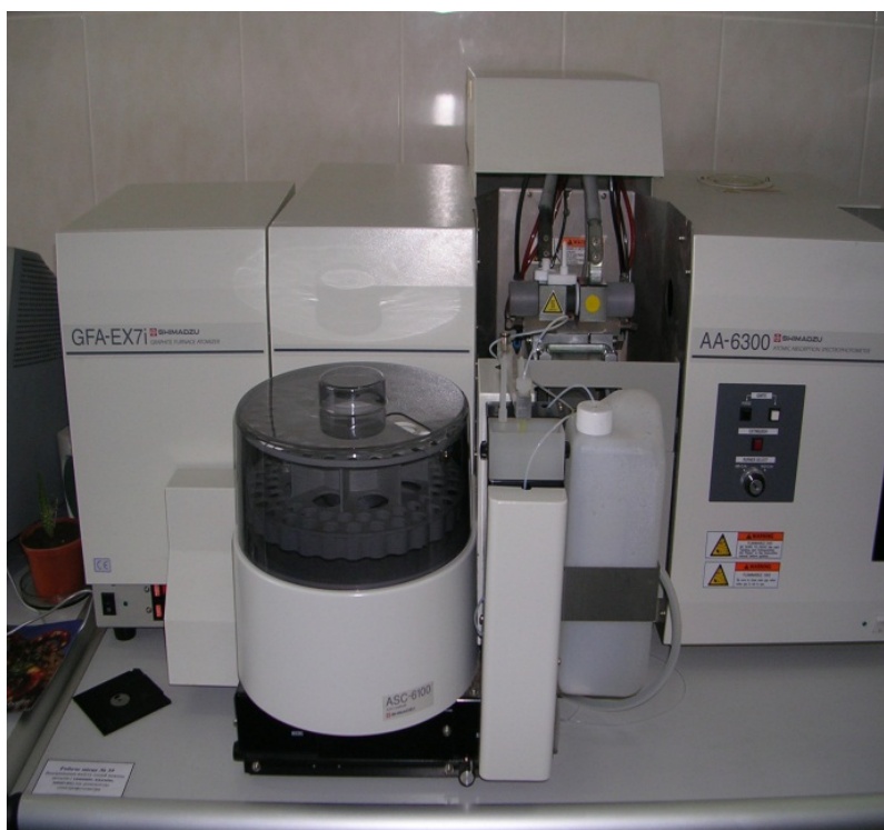
Fig. 7. Atomic absorption spectrophotometer AAS-6300 Shimadzu

metal. Mass fraction of metal in the mineralized samples was calculated by the calibration dependence of absorption magnitude on mass concentration of the metal. Mineralization of samples was carried out in a muffle furnace.