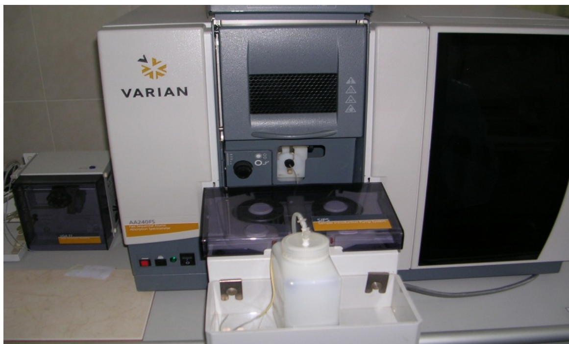
Fig. 6. Atomic absorption spectrophotometer AA240FS Varian

In the course of research, we employed the atomic absorption spectrophotometer AA240FS Varian (Agilent Technologies, USA) and the atomic absorption spectrophotometer AAS-6300 Shimadzu (Shimadzu, Japan), shown in Fig. 6, 7.