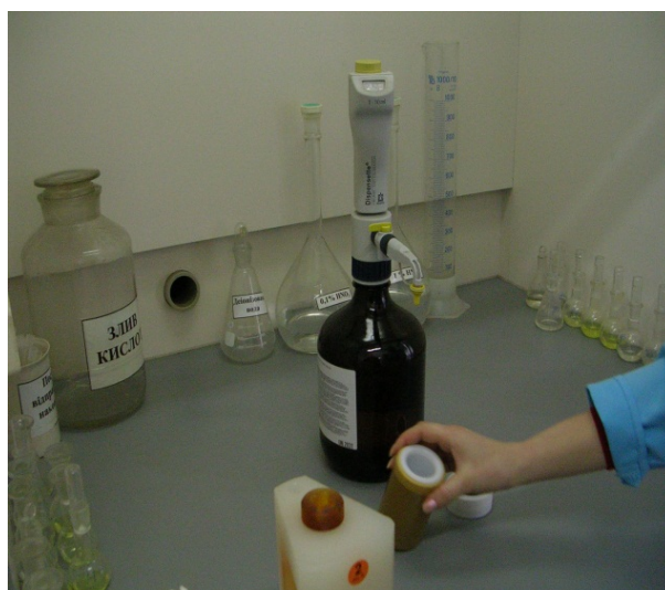
Fig. 3. Adding concentrated nitric acid