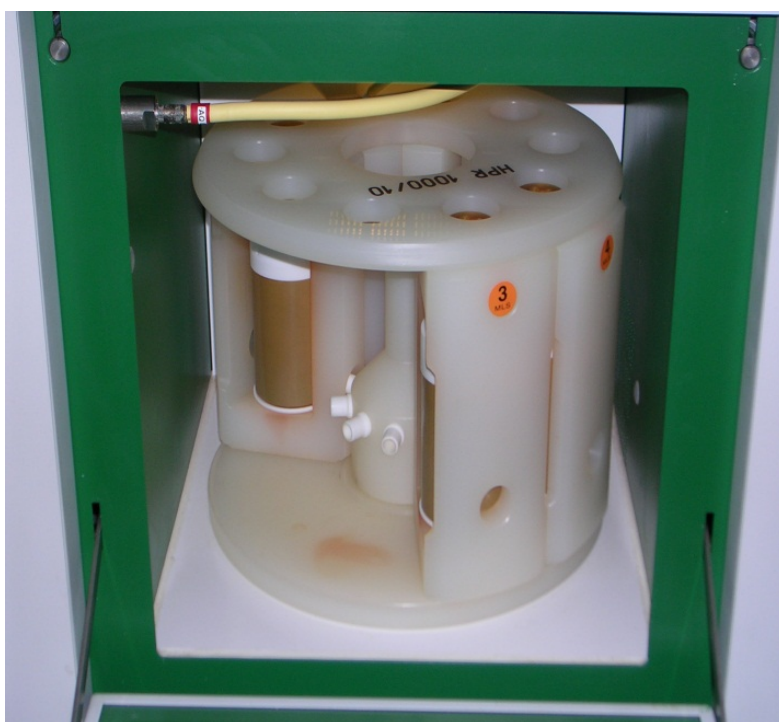
Fig. 5. Placing containers in the mineralizer

We turned on the mineralizer in accordance with the programme of work. Upon completion of operation of the microwave mineralizer, the containers were taken out. The obtained solutions of the samples were poured into measuring flasks of 25 ml with the volume brought to the tag with bidistilled water.