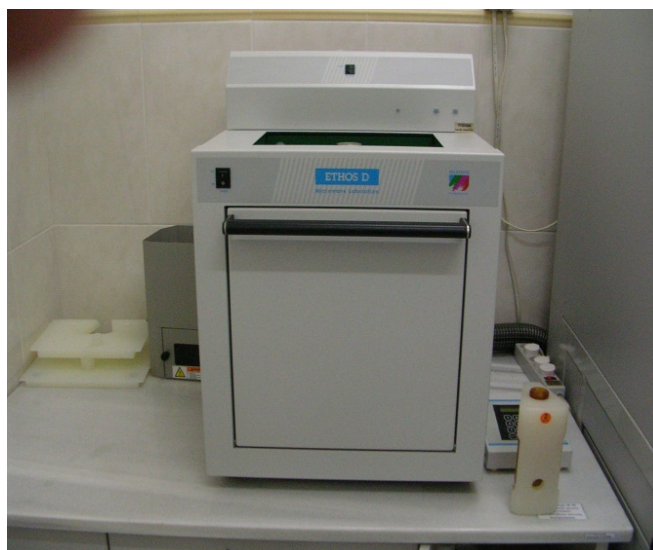
Fig. 1. Mineralizer Milestone ETHOS D