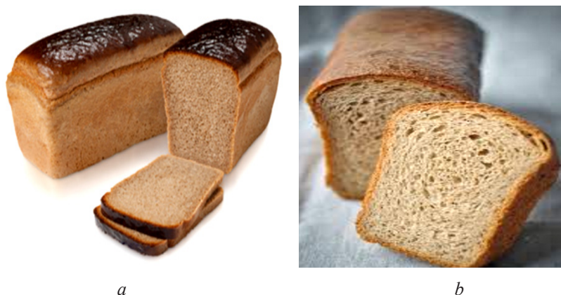
Fig. 1. Experimental bread samples and a device for determining the specific volume: a – bread “Kharkiv Rodnichok”; b – Darnitsky bread

In Fig. 1, 2 shows experimental samples of wheat-rye bread “Kharkiv Rodnichok” and devices used for researches of qualitative indicators of bread.