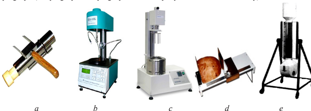
Fig. 2. Devices used for research of qualitative indicators of bread: a – device Zhuravlev; b – penetrometer AP-4/2; c – amylograph-E; d – VFH-250; e – volume RZ-BIO

The specific volume of bread was measured using a RH-BIO volume (Russia); the determination of the porosity of the crumb was carried out on the device Zhuravlev; swelling – on an amylograph (Amylograph “Amylographer-E” company “Brabender” Germany).