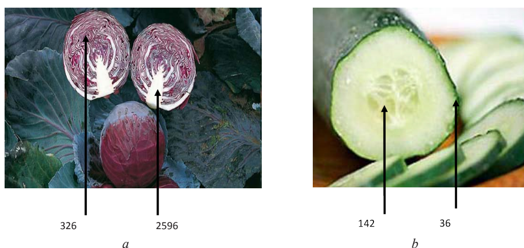
Fig. 5. Distribution of nitrates in vegetables: a – in cabbage; b – in cucumbers, mg/kg

At studying the nitrate distribution in vegetables, it was established ( Fig. 5 ), that in cucumbers, carrot, potato and table beet, the least quantity of nitrates accumulate in the external part of vegetables (near the surface), and the most one – in the central part. At the same time in cabbage and tomatoes, on the contrary, the least quantity – in the central part, the most one – in the area near the base of vegetables (stump).