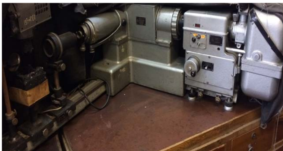
Fig. 2. Spectrometer SDL-1

The quantitative content of accumulated selenium was determined using the fluorimetric method using 2,3-diaminonaphthalene. The studied samples were demineralized at concentrated saline and nitrogen acids with further extraction by hexane. Water phases were poured off, organic ones were studied. The accounting of results was realized at presence and intensity of fluorescence of 4,5-benzopiazoselenol, extracted by hexane. Spectrums of luminescence were determined by a spectrometer SDL-1 (LOMO, Russia) with a mercurial lamp DSM (Lisma, Russia), light filter UVL-2 (Shott, Germany), at waves length 313 and 365nm (Fig. 2).