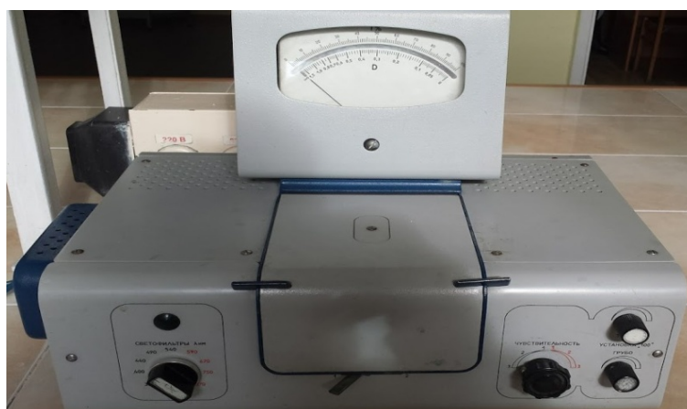
Fig. 1. Photocolorimeter CPC-2-CCC 4.2

Optic density was determined by taking suspension of the studied microorganisms at different cultivation stages. The change of optic density indices was determined using a photocolorimeter CPC-2-CCC 4.2 (AOMP, Russia) (a dish with the distance 1 \text{cm}^3 ) ( Fig. 1 ). According to obtained data, there were built the graphs in semi-logarithmic coordinates and the growth specific speed and generation duration were determined.