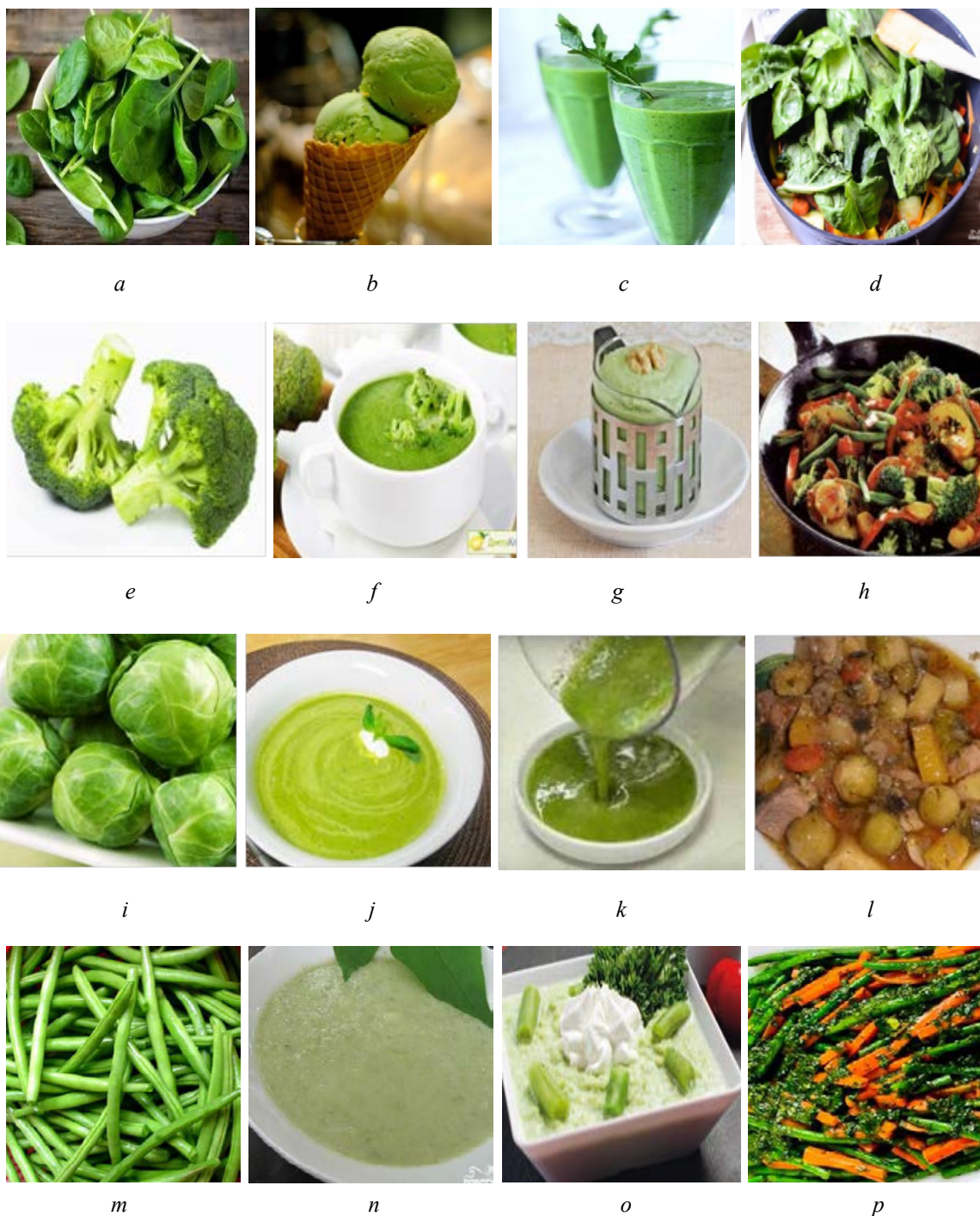
Fig. 3. Chlorophyll-containing vegetables and healthy nanoproducts of them: a, b, c, d – fresh spinach ( a ) and healthy product of it: sorbets ( b ), nanodrinks ( c ), soup-puree ( d ), e, f, g, h – fresh broccoli ( e ) healthy products of it: soup-puree ( f ), sauce-dressing ( g ), vegetable ragout ( h ); i, j, k, l – fresh Brussels cabbage ( i ) and healthy products of it: soup-puree ( j ), sauce-dressing ( k ), vegetable ragout ( l ), m, n, o, p – fresh leguminous haricot ( m ) and healthy products of it: soup-puree ( n ), sauce-dressing ( o ), vegetable ragout ( p )