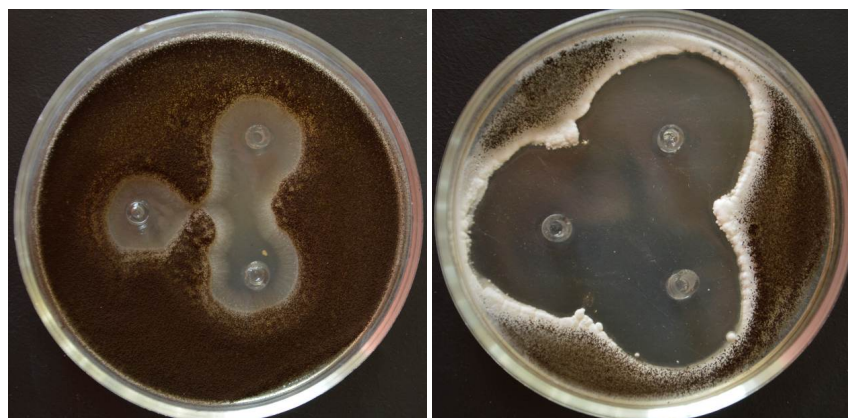
Fig. 2. Effect of the means «HSG dez 2» with concentrations 0,005 and 0,02 % on micromycetes A. niger