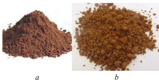
Fig. 1. Grape seeds powder: a – GSP; b – DGSF

Powders were obtained under industrial conditions. At first grape seeds were separated from pomace, dried at a room temperature and subjected to the thorough purification (separation). Then GSP (grape seed powder) was obtained by superfine grinded. Another powder type DGSF (defatted grape seed flour) was obtained by extraction of oil of grape seeds by cold pressing. Pomace, created after grape seed pressing was superfine grinded up to flour. This powder type is a commercial product at the Ukrainian trade market, realized as a trademark OleoVita (Orion, Ukraine) ( Fig. 1 ).