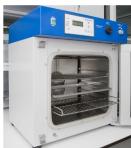
Fig. 2. Drying cabinet for measuring muffin humidity

Mass fraction of moisture is carried out in a drying cabinet by drying to constant weight at a temperature of 102 °C ( Fig. 2 ).