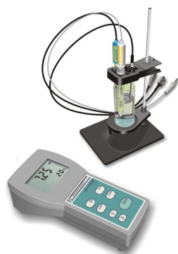
Fig. 3. pH meter to study the alkalinity of finished products PH-150MI