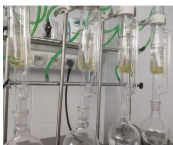
Fig. 1. Soxhlet device

Mass fraction of moisture is carried out in a drying cabinet by drying to constant weight at a temperature of 102 °C ( Fig. 2 ).