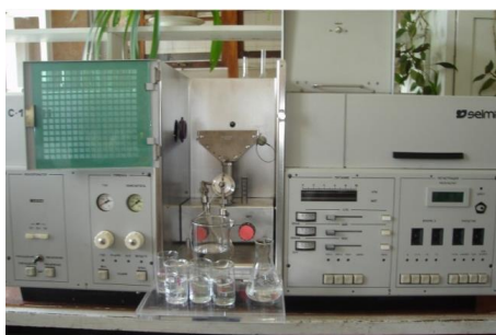
Fig. 4. Atomic absorption spectrophotometer S-115M1-PK

In order to determine the safety of muffins new formulations, standard techniques were used. Thus, copper, zinc, lead and cadmium were determined by the atomic absorption method, arsenic by the colorimetric method, mercury by the method of flameless atomic absorption [13].